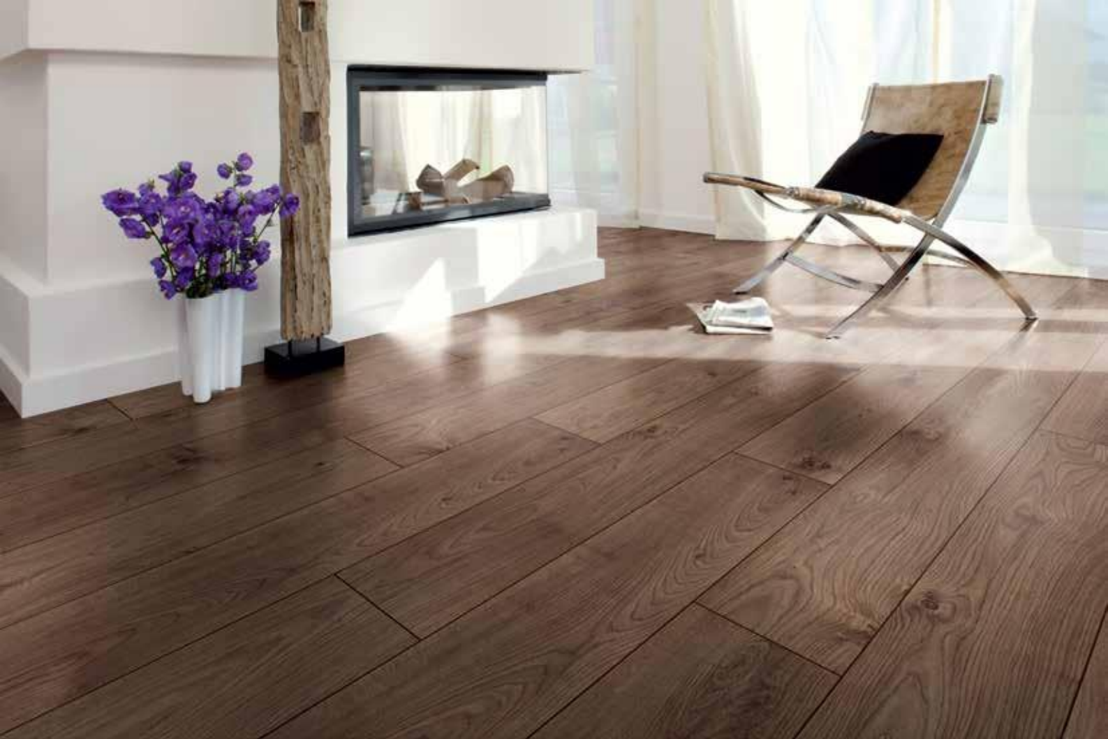
Atlas Oak Coffee - D 3591 ER