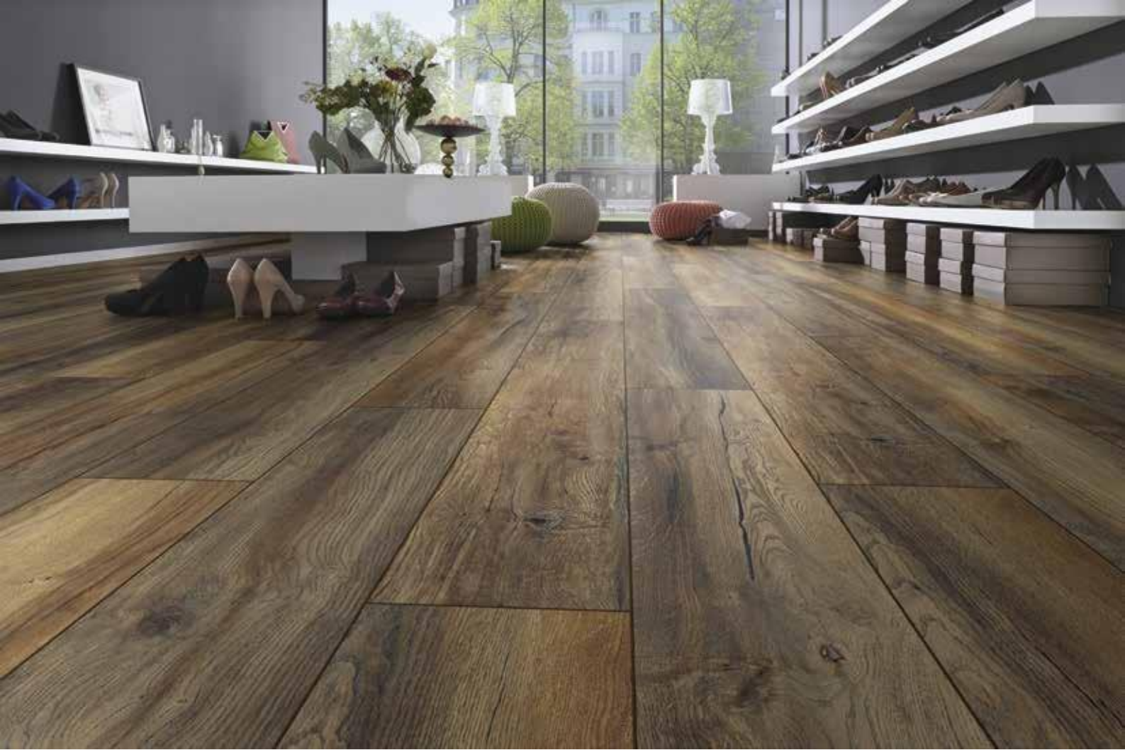
Harbour Oak - D 3570 ER