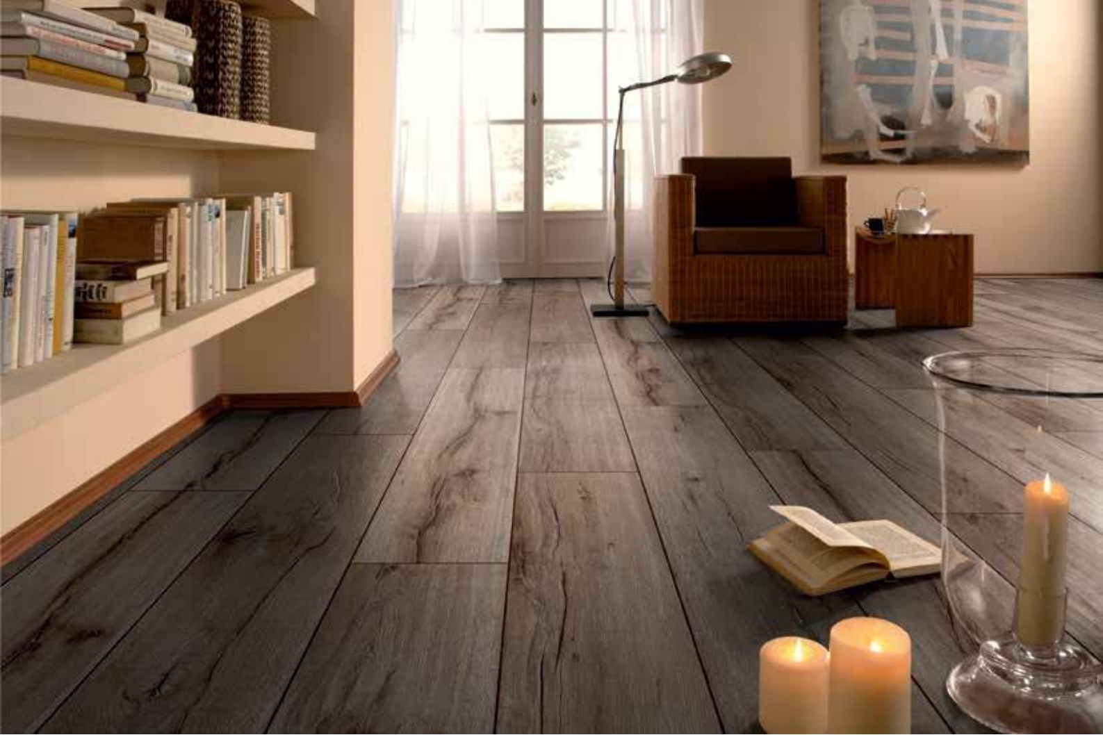
Rip Oak - D 3075 MX