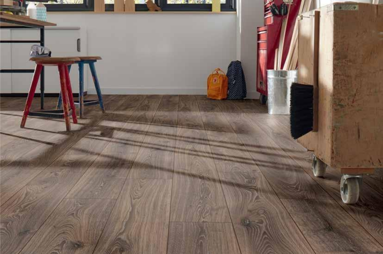
Timeless Oak - D 3590