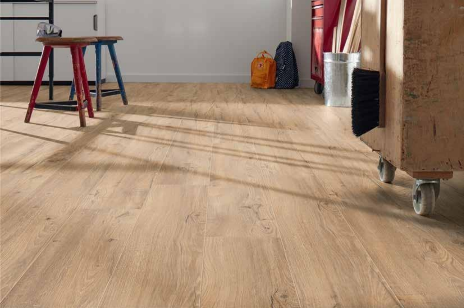
Premium Oak Nature - D 4955 AF