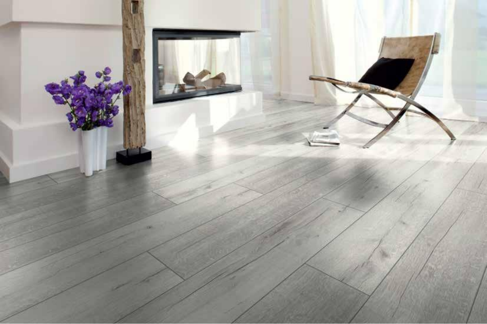
Rip Oak White - D 3181 MX