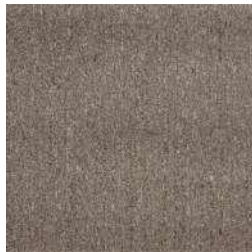
81 LIGHT BROWN