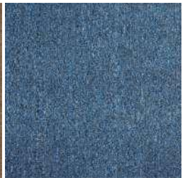
84 SKY BLUE