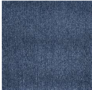
85 DARK BLUE