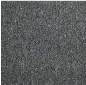
87 LIGHT GREY