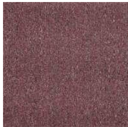
90 LIGHT RED