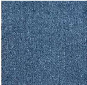
86 OCEAN BLUE